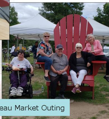
Rosseau Market Outing