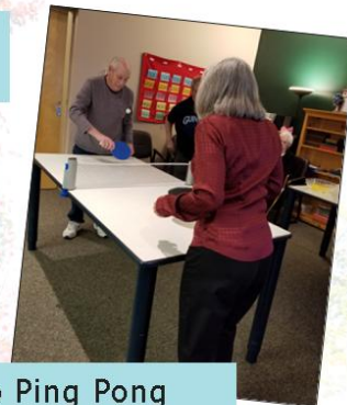
Fun from Pool Noodles to Ping Pong