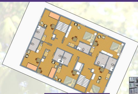
Burk's Falls Building Project