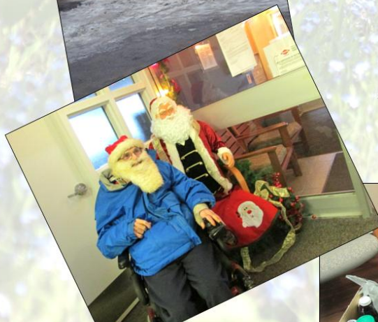
Ho Ho Ho Gino & Forest Hill Food Drive