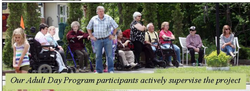
Our Adult Day Program participants actively supervise the project