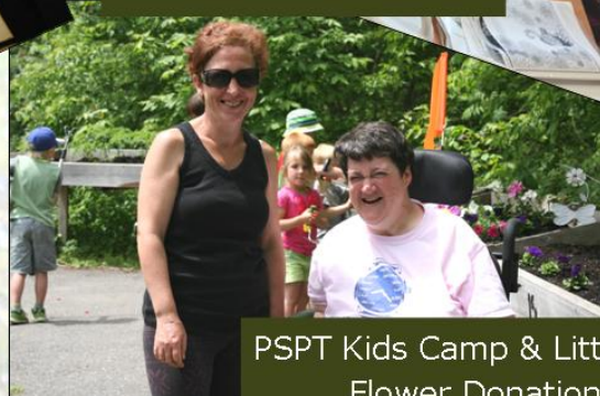
PSPT Kids Camp & Little Gardens Flower Donation Day