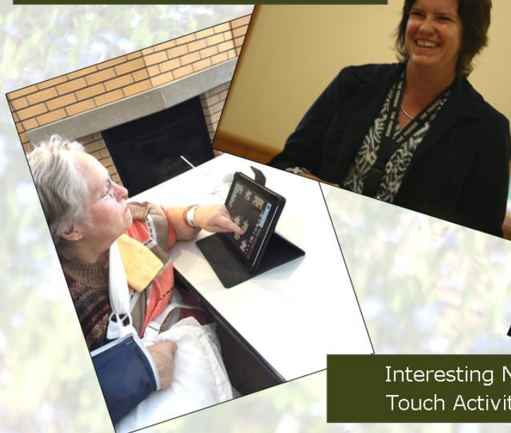
Interesting New Touch Activities