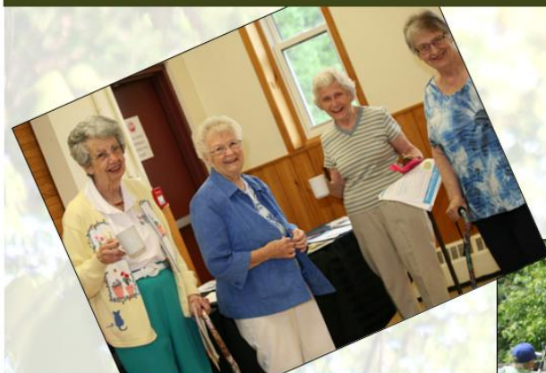
Rainy Day Colouristas in Gravenhurst